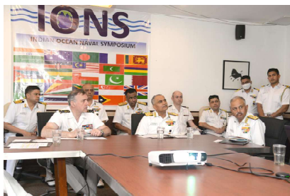
The officers participating in the Indian Ocean Naval Symposium (IONS) Maritime Exercise 2022 (IMEX-22).

22 Observers from 15 IONS member navies, namely Australia, Bangladesh, France, India, Indonesia, Maldives, Mauritius, Mozambique, Oman, Qatar, Singapore, Sri Lanka, Thailand, UAE, and the UK also participated in the exercise. The participants val-